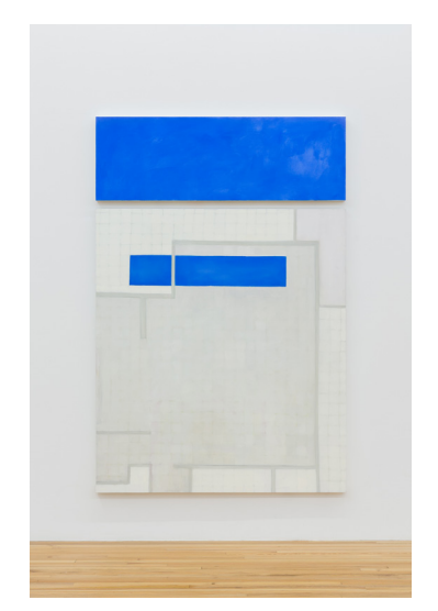
KIM DINGLE Mechanic's Lap Pool - Restaurant Mandala, 2012/2020

Oil on canvas Diptych: 86 x 60 in (218.4 x 152.4 cm) overall (KD20-004)