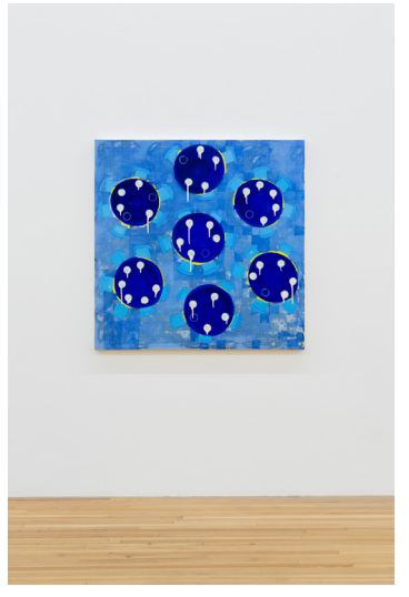
KIM DINGLE Help Wanted - Restaurant Mandala, 2012/2020

Oil on canvas Diptych: 86 x 60 in (218.4 x 152.4 cm) overall (KD20-004)