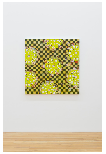
KIM DINGLE Full Service - Restaurant Mandala, 2012/2020

Oil on canvas Diptych: 86 x 60 in (218.4 x 152.4 cm) overall (KD20-003)