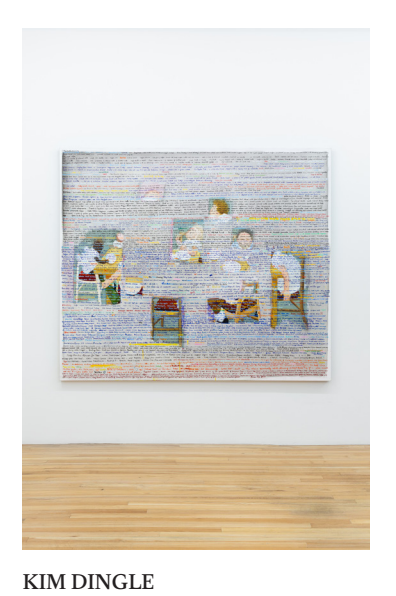
Menu, 2019 Oil on linen 72 x 84 in (182.9 x 213.4 cm) (KD20-012)