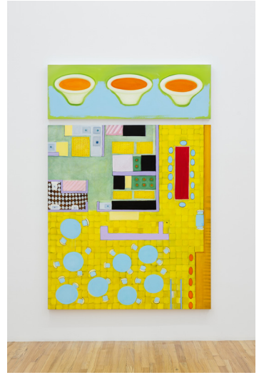
KIM DINGLE Tomato Bisque - Restaurant Mandala, 2012/2020

Oil on canvas 48 x 48 in (121.9 x 121.9 cm) (KD20-009)