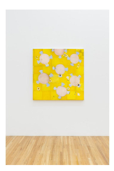
KIM DINGLE Help Wanted - Restaurant Mandala, 2012/2020

Oil on canvas 48 x 48 in (121.9 x 121.9 cm) (KD20-006)