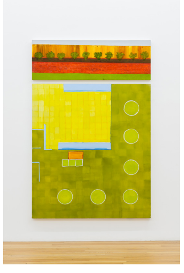
KIM DINGLE Herb Garden Patio - Restaurant Mandala, 2012/2020

Diptych: 44 x 60 in (111.8 x 152.4 cm) overall (KD20-013)