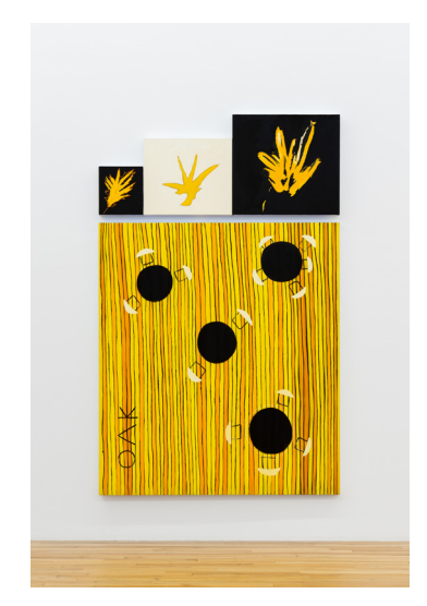
KIM DINGLE OAK - Restaurant Mandala , 2012/2020

Oil on canvas Diptych: 86 x 60 in (218.4 x 152.4 cm) overall (KD20-007)