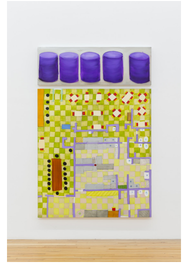
KIM DINGLE Purple Ottomans - Restaurant Mandala, 2012/2020

Oil on canvas Diptych: 86 x 60 in (218.4 x 152.4 cm) overall (KD20-007)