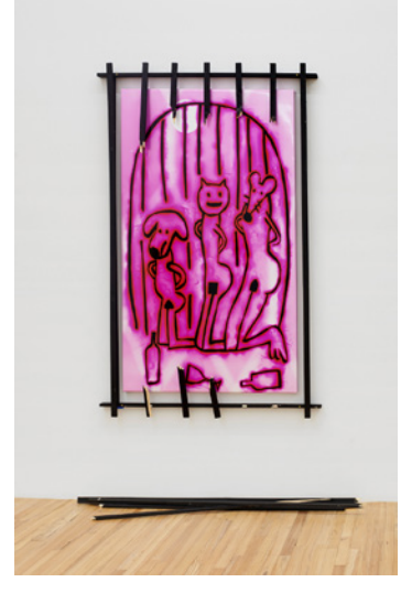
HADI FALLAHPISHEH Arrests, 2020

25 x 20 x 17 inches (63.5 x 50.8 x 43.2 cm.)