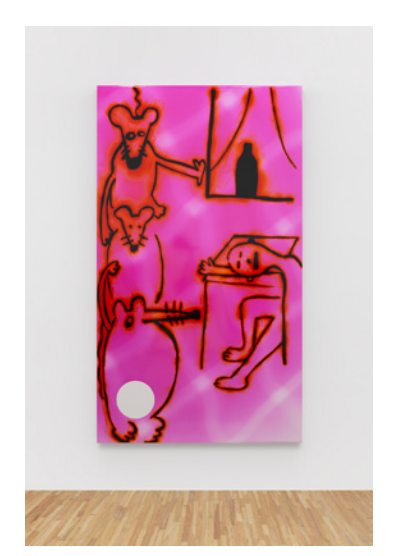
HADI FALLAHPISHEH Three Friends, 2020 Unique light drawing on photosensitive paper 75 x 43 x 2 inches (190.5 x 109.2 cm.); fencing element: 87 x 56 x 3 1/4 inches (221 x 142.2

x 8.3 cm.) Installed dimensions variable