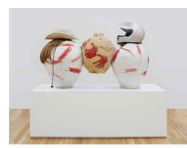
HADI FALLAHPISHEH Two Americans Breaking a Persian Pot, 2020 Glazed ceramic pots, felt hat, wig, motorcycle

helmet, honeycomb 31 x 48 x 17 inches (78.7 x 121.9 x 43.2 cm.)