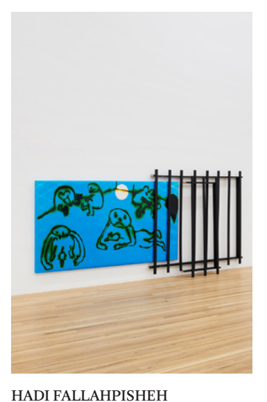
Penthouse, 2020 Unique light drawing on photosensitive paper, fencing 43 x 84 x 2 inches (109.2 x 213.4 x 5.1 cm.); fencing elements: 56 x 26 x 3 1/4 inches (142.2 x 66 x 8.3 cm.) and 56 x 67 5/8 x 3 1/4 inches (142.2 x 171.8 x 8.3 cm.) Installed dimensions variable