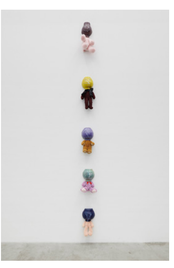
HADI FALLAHPISHEH Stabbed Pots, 2020 Stuffed animals, glazed ceramic pots Dimensions variable

x 8.3 cm.) Installed dimensions variable