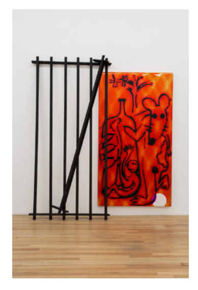
HADI FALLAHPISHEH Message in a Bottle, 2020 Unique light drawing on photosensitive paper 78 x 43 x 2 inches (198.1 x 109.2 cm.); fencing element: 92 x 45 x 3 1/4 inches (233.7 x 114.3 x 8.3 cm.) Installed dimensions variable