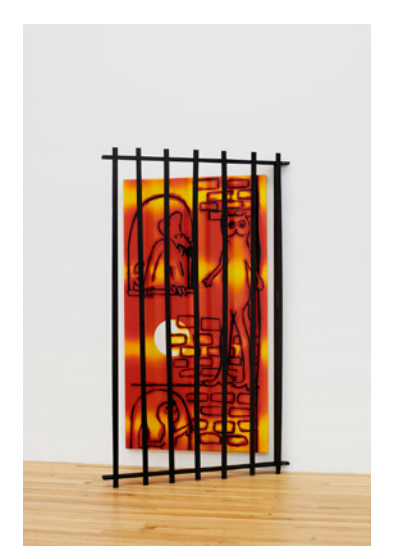
HADI FALLAHPISHEH Downtown Neighbor, 2020 Unique light drawing on photosensitive paper 83 x 44 x 2 inches (210.8 x 111.8 cm.); fencing element: 95 x 56 x 3 1/4 inches (241.3 x 142.2

x 8.3 cm.) Installed dimensions variable