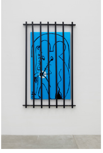
HADI FALLAHPISHEH Bad Thoughts, 2020 Unique light drawing on photosensitive paper 71 x 42 x 2 inches (180.3 x 106.7 cm.); fencing element: 91 x 56 x 3 1/4 inches (231.1 x 142.2 x 8.3 cm.)