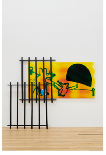
HADI FALLAHPISHEH Are We Home, 2020

Unique light drawing on photosensitive paper, fencing