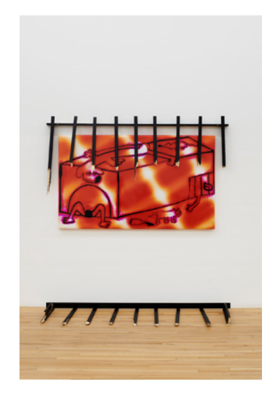
HADI FALLAHPISHEH American Circle, 2020

Unique light drawing on photosensitive paper, fencing