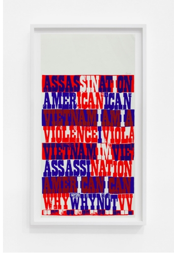
CORITA KENT american sampler, 1969

Screenprint 23 1/8 × 12 1/8 in (58.7 × 30.8 cm) (CK20-062)