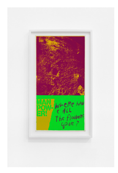
CORITA KENT moonflowers, 1969

Screenprint Yellow: 22 ¾ × 11 % in (57.8 × 29.5 cm); green: 22 ¾ × 11 % in (57.8 × 28.9 cm) (CK19-008)