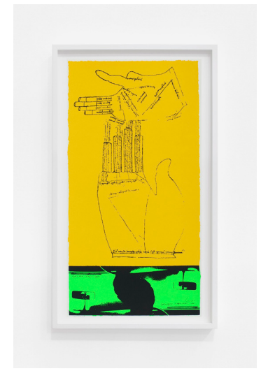
CORITA KENT green fingers, 1969

Screenprint 23 × 35 inches (58.4 × 88.9 cm.) (CK21-004)