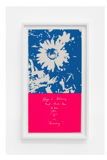
CORITA KENT i in daisy, 1969

Screenprint 23 × 12 inches (58.4 × 30.5 cm.) (CK20-094)