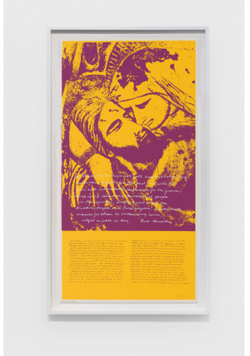
CORITA KENT pieta 1969, 1969

Screenprint 23 × 9 inches (58.4 × 22.9 cm.) (CK21-010)