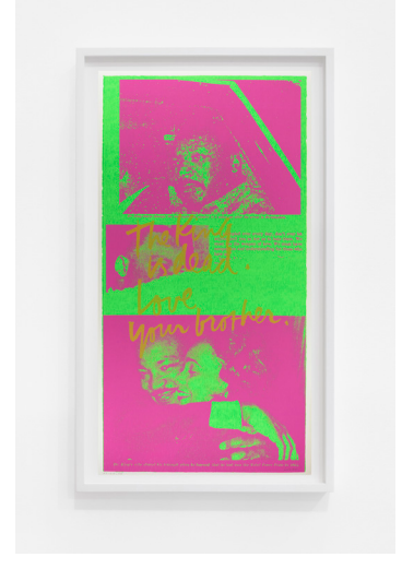
CORITA KENT love your brother, 1969

Screenprint 22 ½ × 11 ½ in (57.2 x 29.2 cm) (CK20-022)