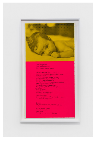
CORITA KENT christy, 1969

Screenprint 23 × 12 inches (58.4 × 30.5 cm.) (CK20-021)