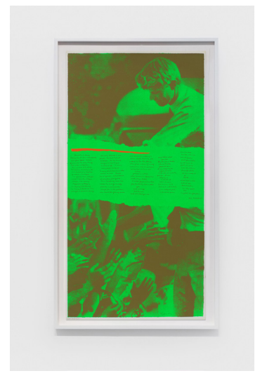
CORITA KENT i'm glad i can feel pain, 1969

Screenprint 23 × 12 inches (58.4 × 30.5 cm.) (CK21-011)