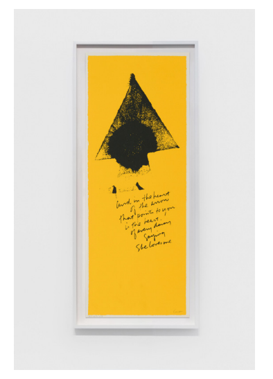
CORITA KENT heart of the arrow, 1969

Screenprint 23 × 12 in (58.4 × 30.5 cm) (CK19-033)