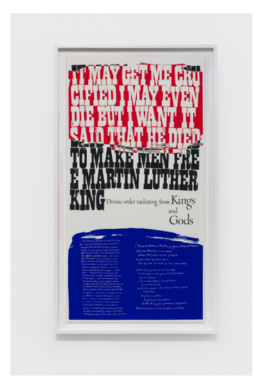
CORITA KENT king's dream, 1969

Screenprint 23 \times 12 inches (58.4 × 30.5 cm.) (CK19-032)