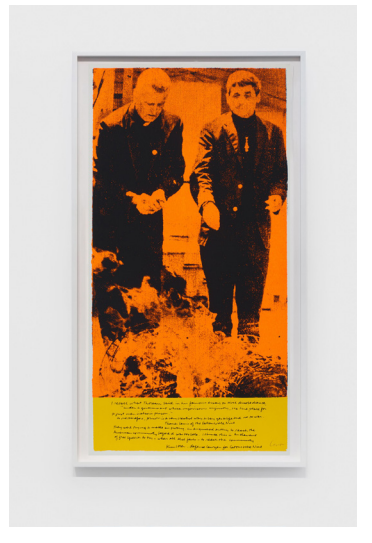
CORITA KENT phil and dan, 1969

Screenprint 22 ½ × 11 % in (57.2 × 30.2 cm); framed: 26 × 15 × 1 ½ in (66 × 38.1 × 3.8 cm) (CK19-010)