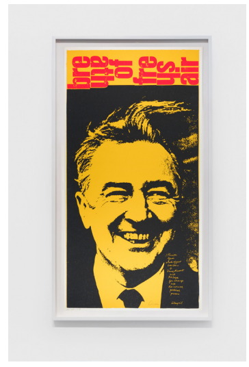
CORITA KENT a breath of fresh air, 1969

Screenprint 22 ½ × 11 ½ in (57.2 x 29.2 cm) (CK21-017)