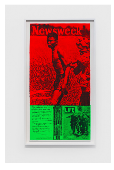
CORITA KENT news of the week, 1969

Screenprint 23 1/8 × 12 1/8 in (58.7 × 30.8 cm) (CK20-062)