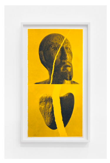
CORITA KENT sacred heart, 1969

Screenprint 22 ½ × 11 ½ in (57.2 x 29.2 cm) (CK19-011)