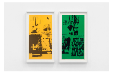
CORITA KENT road signs (part 1 and 2), 1969

Screenprint 22 ½ × 11 ½ in (57.2 x 29.2 cm) (CK21-015)