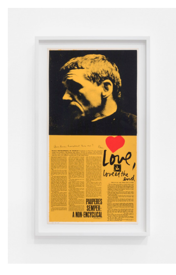
CORITA KENT love at the end, 1969

Screenprint 22 ½ × 11 % in (57.2 × 30.2 cm); framed: 26 × 15 × 1 ½ in (66 × 38.1 × 3.8 cm) (CK19-010)