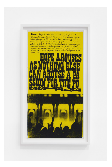
CORITA KENT a passion for the possible, 1969

Screenprint 23 × 12 inches (58.4 × 30.5 cm.) (CK19-024)