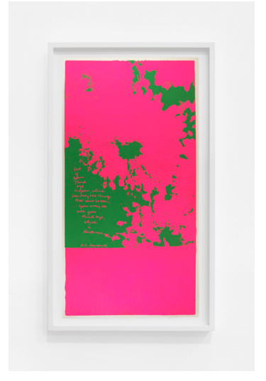
CORITA KENT third eye, 1969

Screenprint 23 × 12 inches (58.4 × 30.5 cm.) (CK19-028)