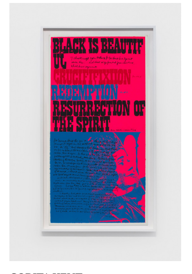
CORITA KENT if i , 1969

Screenprint 22 ½ × 11 ½ in (57.2 x 29.2 cm) (CK21-018)