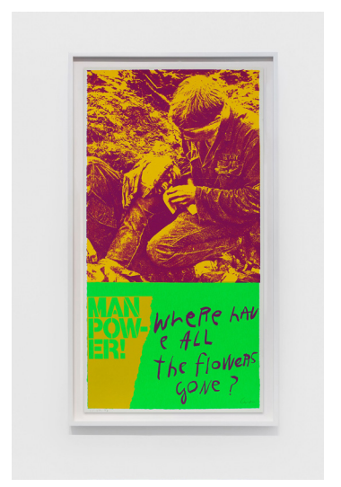
CORITA KENT manflowers, 1969

Screenprint 23 1/8 × 12 1/8 in (58.7 × 30.8 cm) (CK21-016)